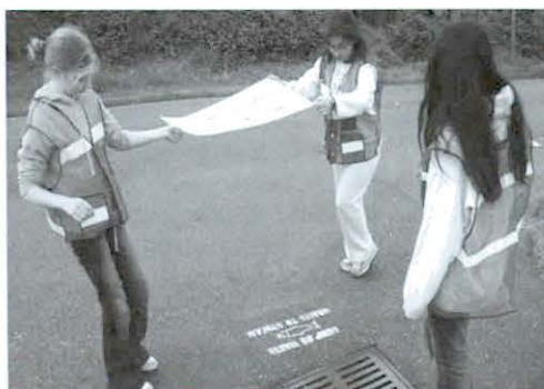
Girl Scout Troop 6 Cadets stencil drains.

To promote environment awareness volunteers, including the Troop 6 Girl